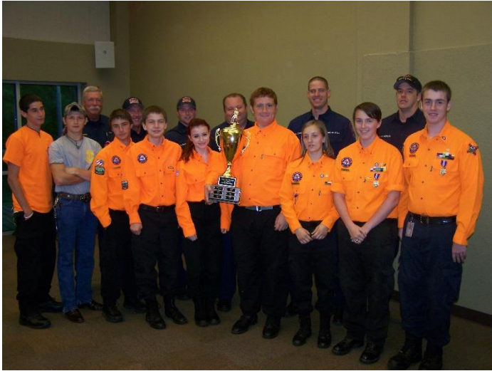
Class A Uniforms