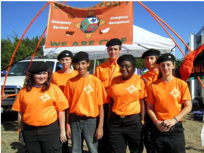
Class B Uniforms